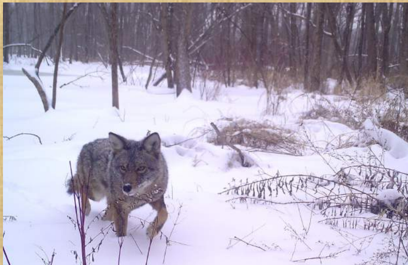
WiDNR Snapshot WI—River Bend Nature Center

Students will enjoy seeing and feeling pelts and skulls from various native species in Southeastern Wisconsin and even some species outside of the area. How are predators structurally different from their prey? How do dentures play a role in what an animal eats? How do animals adapt to survive in their environments—especially those who stick around during the winter? All these questions and more will be explored in this very special in-school program.