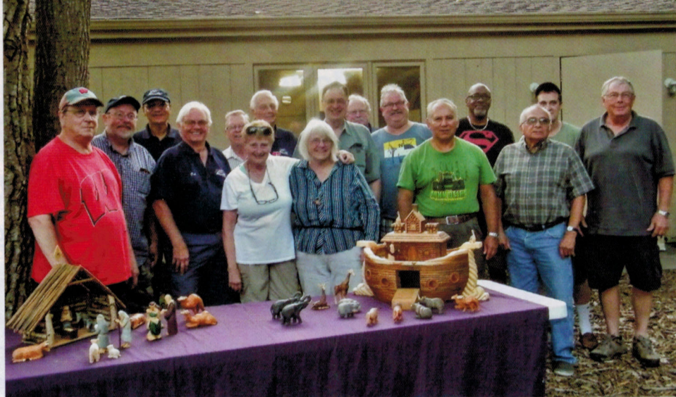
Members of the River Bend Carving Club of Racine, Wis., display their carvings of Noah's ark and the Nativity at the club's annual art fair.